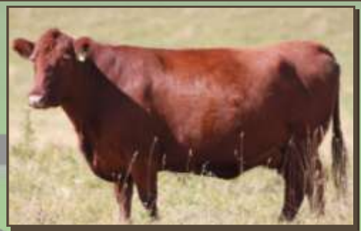
Red ted hobo 17j dam of lot 13