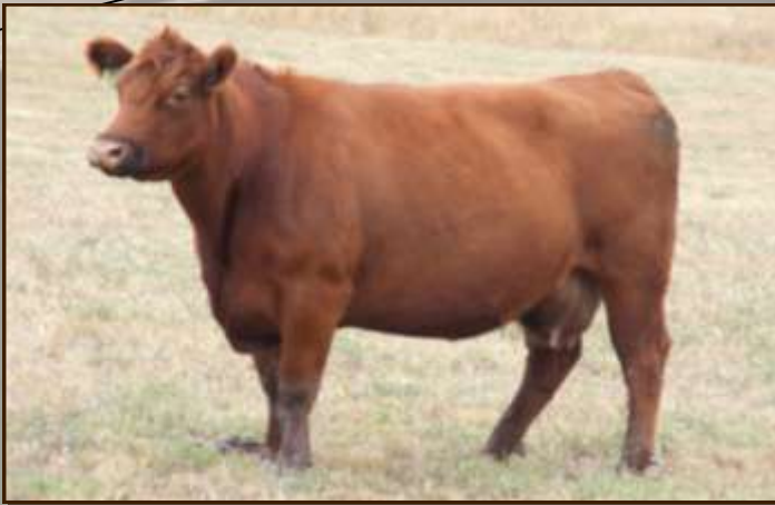
Glacier marias 27n - dam of lot 78