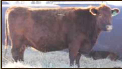
Catalyst 148s dam of lot 59

59Y_ A long bodied cow bull with a unique pedigree. An excellent disposition with sound feet and legs.