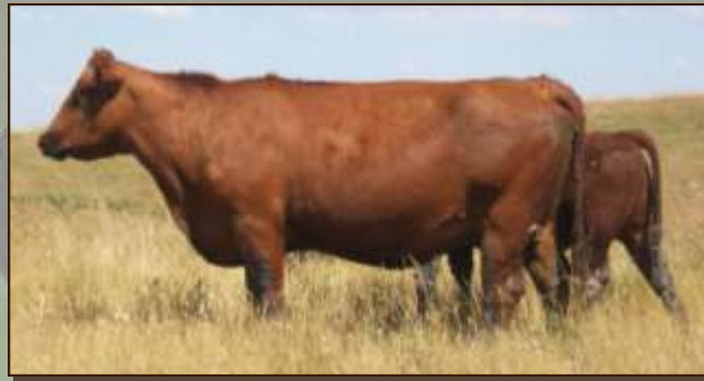
RAMBLER 53M dam of lot 111