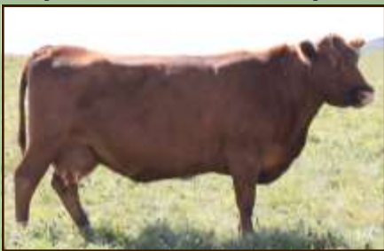
Red ted Somethin 99g grandDam of lot 19 & lot 162