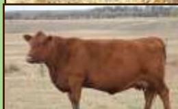
107T's dam Red Ted Gold Robber 23L