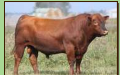
Half brother to lot 12 Used in our commercial herd of 2011