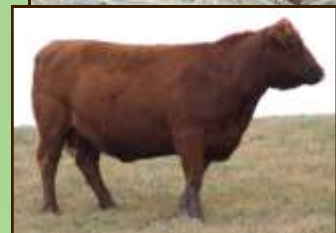
GLACIER LOGAN 6M dam of lot 110