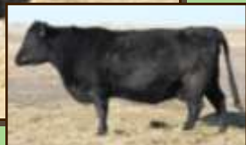
Revival 113-dam of lot 134

134Y If you want length and thickness then this is your bull. He will go out to your cow pasture and really cover some ground and give you good results. His dam is extremely long and thick just like him and that's where the little extra BW comes from.