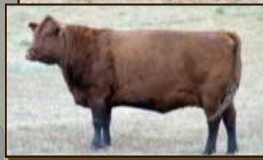
Cheyenne 111P dam of lot 103

106Y Another Catalyst son that seems to click with everything we use him on. A low BW and even lower EPD, with a lot of hair. Use him on the heifers and not only get calving ease but some growth in the calves.