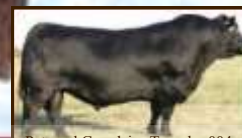
Paternal Grand sire-Traveler 004