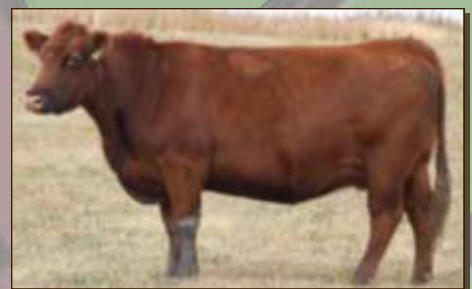
glacier marias 101 dam of lot 28