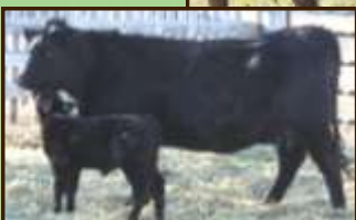
14x - Half sister to lot 134