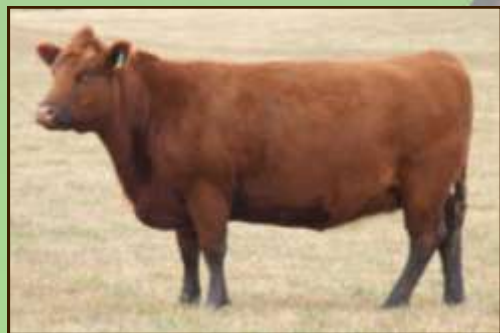
New trend 29r - dam of lots 86& 87

86Y A twin bull that came off pasture at 826 lbs . An excellent cow that gave us twin bulls two years running.