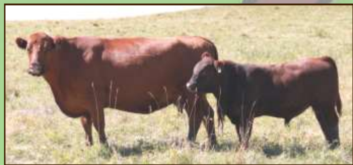
Prewearing Snapshot of Lot 101 with his dam 31m