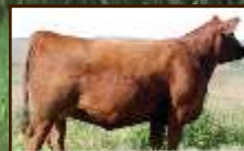
Bank Statements Daughter