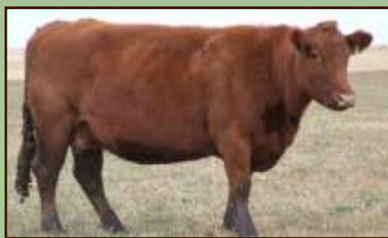
Kinchen sagebrush 16r dam of lot 91