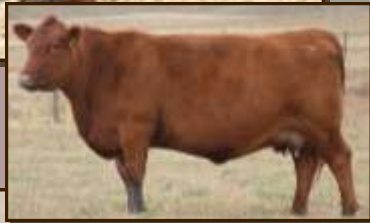
goldrobber 231 -dam of catalyst 107t & Dam of lot 22