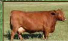
Bank Statements Dam