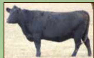
Extra h6 95p dam of lot 25

75Y The Alliance 151S dam continues to kick out a low BW bull calf year after year. She had son to Parkland Colony in 2010 and another one go to Fath's in 2011.